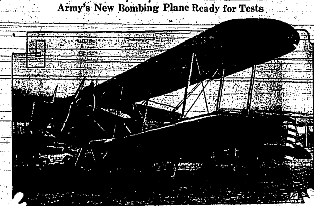
THE ARMY AIR CORPS' new bombing plane Panther is ready for performance tests in Washington. The plane carries 2200 pounds of bombs and is equipped with five machine guns capable of keeping off enemy planes as it flies to its objective.

HILLS BROS COFFEE First time the only... COFFEE