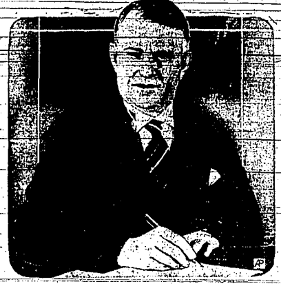
MORGAN F. LARSON, new governor of New Jersey, at his desk at Trenton following his inauguration.