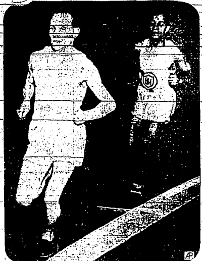
EERO NURMI, Finland's truck star, shattered three old records in his first appearance during his present tour when he ran the 3,600 meters in 7 minutes 42.25 seconds in a special race in Indianapolis.