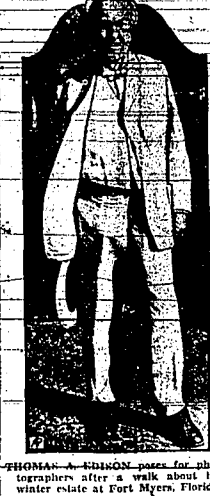
THOMAS A. EDISON poses for photographers after a walk about his winter estate at Fort Myers, Florida.