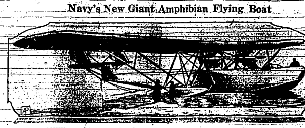
The Navy's new amphibian flying boat, YXPA-1, which can be converted into a commercial transport carrying 32 passengers, has a wing span of 100 feet. It is one of the largest flying boats ever built in the United States. It is being tested at Anacostia air station in Washington.

into right thinking. This process is going on, but slowly. It may take generations yet to develop mass thinking to a point where people will rally to a better peace as readily as they now rally to go to war.