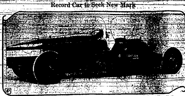
Record Car to Seek New Mark