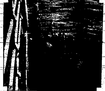
BOATLOAD OF PASSENGERS from the President Garfield, which went aground on a Bahama reef, being rescued by the Munson liner Pan-America in a calm sea after the storm.

house today and sent to the senate. The measure would permit state officers to enforce state compulsory school attendance laws upon Indians living in the state.