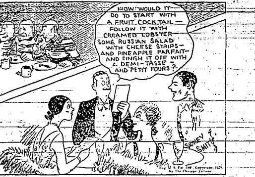
How would it do to start with a fruit cocktail.

"I heard of it in the legends of my people," Nikka said.