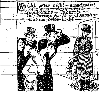
Light after night—a mad whirl of pleasure.

"I heard of it in the legends of my people," Nikka said.