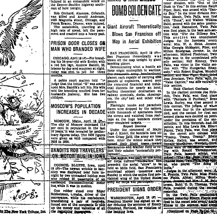
A Tough Neighborhood To Raise a Family

Utahn perishes under tons of ore at mine.