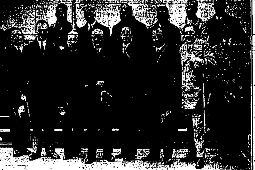
EUROPEAN JOURNALISTS, guests of the Carnegie endowment for international peace, are on board the S. S. Berlin. They will make a two month tour of the United States studying the social, political, economic and spiritual life of the country.