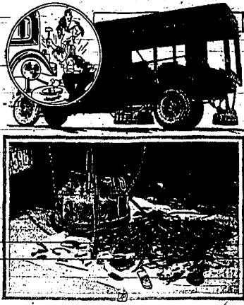
Potential puncture causes are cleared off Missouri roads by magnets attached to a truck.

Electric Drives Cleared Tons of Bolts, Nails, Staples, Tin Cans and Scrap Iron From Cracked Highways (By The Associated Press) JEFFERSON CITY, Mo., May 26.—Missouri motorists are being saved about $500 a day in expense and grief from punctures.