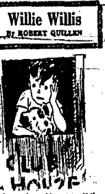
Willie Willis By Robert Quillen

Woolen-wool fleeces are looking good at this time. Mr. Curran said reports from eastern markets are to the effect that lambs that have reached the market from South Idaho are dressing out exceptionally well and being used with but little