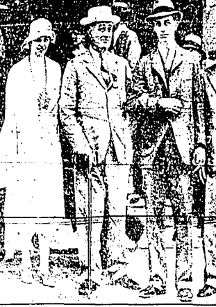
GOVERNOR FRANKLIN D. ROOSEVELT, New York, photographed while attending the conference of governors in Salt Lake City...