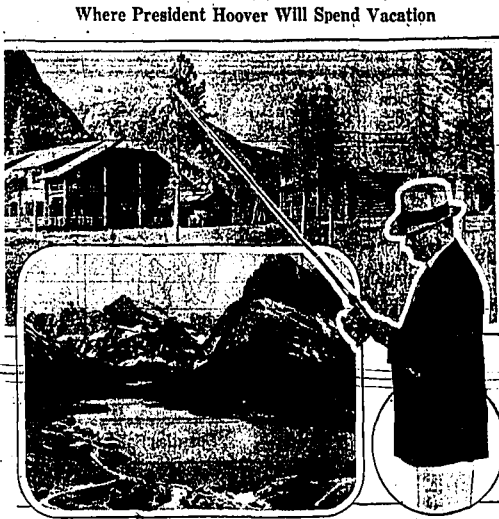
Where President Hoover Will Spend Vacation. The two cabins shown above are on the presidential camp site and Swiftcurrent lake (below), which is conveniently near, will probably challenge the skill of the nation's foremost fisherman.—(A) Photo.

Under the general superintendency of Mrs. H. W. Clouchek, Twin Falls, the exhibits at the fair this year have been departmentalized even more extensively than in the past. In order to fill more fully and adequately the fair, the creating number of exhibits in handwork, arts and products of the pantry, flower garden and school room. Two buildings on the 40-acre fairgrounds are given over to the women's department and they are among the most popular on the grounds, not alone for women, but for men as well. It is asserted by Mrs. Clouchek, who sometimes wonders if more men do not view the tempting array of canned products, cakes, jellies and other exhibits than women.