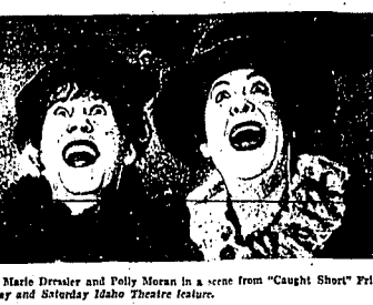
Marie Dressler and Polly Moran in a scene from "Caught Short" Friday and Saturday Idaho Theatre feature.

"OZAR OF BROADWAY" APPEARS AT ORPHEUM: It is in the type of picture such as "Ozar of Broadway" which appeal at the Orpheum theatre today.