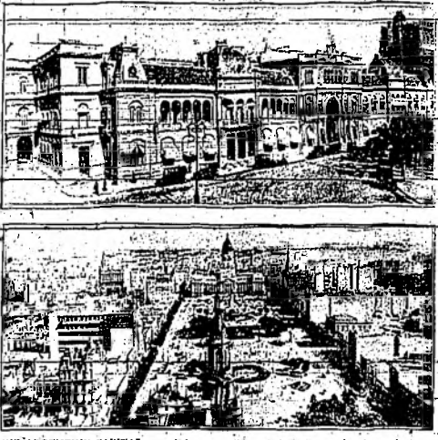
THE ARGENTINE CAPITAL armed for a possible revolutionary outbreak against the government of President Hipolito Yrigoyen. The presidential palace (upper picture) is surrounded by machine guns, following reports of a possible attempt against the president's life. Lower picture shows the Plaza Congreso with the capitol in the center.