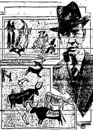
Painted figures of wasp-waisted women (above) and crude animal sketches (below) are found in prehistoric caves of France and Spain studied by Ambassador Charles C. Dawes.

NEW HAVEN, Conn., Sept. 4 (AP)—About 20,000 years ago—one of the prehistoric periods studied by Charles C. Dawes in France and Spain—the two perfectly preserved are many of cave women wore long skirts and a fitted wasp waistline. The record of these styles was made by cave men artists, carved on rocks of cave walls, frequently embellished in reds, browns and black. O. Dawes in France and Spain—the two perfectly preserved are many of cave women wore long skirts and a fitted wasp waistline. The record of these styles was made by cave men artists, carved on rocks of cave walls, frequently embellished in reds, browns and black.