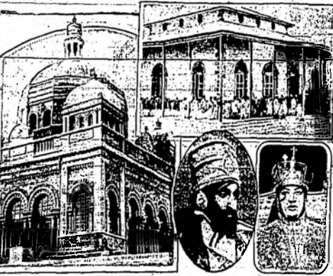
St. George's church (left), Addis Ababa, Abyssinia, scene of the brilliant pageant attending the enthronement of His Imperial Haile Selassie I, emperor of the Ethiopians. His nephew, Walzeru Menen, is shown lower right. Above is one of the buildings in the palace group.