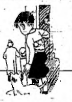
"George Washington couldn't tell me who was a kid, but I guess they had a sense to say his mother wasn't at home when the installment man came."