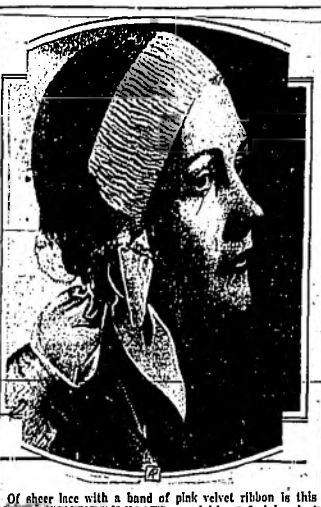
Of sheer lace with a band of pink velvet ribbon is this dance cap of black and silver. A graceful bow of pink velvet ribbon finishes the hat at the right, back.