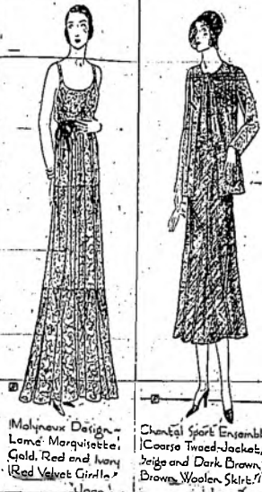
Molyneux Design—Lome Marquisee! Gold, Red and Navy Red Velvet Girdle