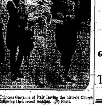
KING BORIS OF BULGARIA and Princess Giovanna of Italy leaving the historic Church of St. Francis at Assisi, Italy, following their recent wedding—(AP) Photo.