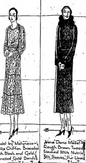
Model by Molyneux—White Chiffon Brocade With Black and Gold, Inverted Gold Bands