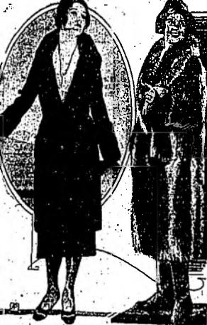
When milady rides she will find the raccoon coat especially chic, but on the avenue she may prefer the attractive fur-trimmed tailcoat of black broadcloth and caracul.