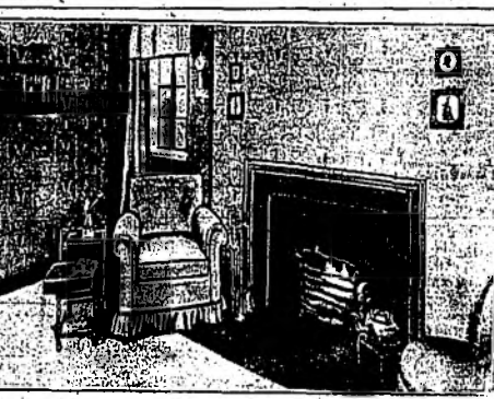
Two big chairs and a fireplace bespeak friendly comfort.

By HOPE HAYMOND Interior Furnishings Editor, The Woman's Home Companion, Writer for The Twin Falls News