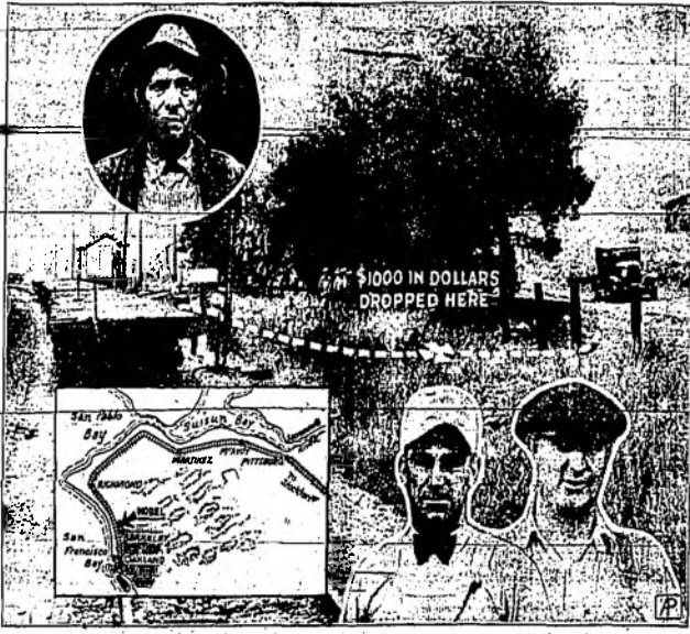
FIVE OR SIX ARMED MEN held up and robbed the Southern Pacific Oakland-Stockton train of an estimated $60,000 at Nobles, California. (indicated by arrow on map) and escaped in a stolen automobile. The holdup gang dropped $10,000, the route being indicated from top of first car where bandits were thrown from the mail car to the bank of the roadbed. Y. A. Ganga (oval inset) was an eye witness.

will have charge of the distribution of the barlets. At a meeting of the boys of the high school held yesterday in Room 20, Principal U. M. Terry outlined the plan for the barlets.