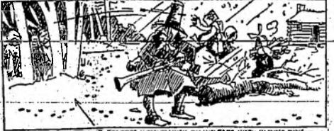
THE LOCAL NEIGHBORHOOD SOCIETY WENT THROUGH ON WELFARE WORK IN THESE DAYS AND MAY BE CALLED IN A MOMENT TO HELP IN A BULLISH FIVE.

Consider Those Who Set Aside Thanksgiving Day