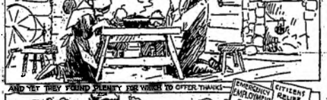
AND YET THEY FOUND THEMSELVES FOR WISE TO OFFER THANKS.