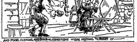
AND FOOD, CLOTHING AND OTHER CONDITIONS WERE NOTHING TO BOAST OF.