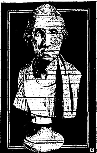
This rare bust of George Washington, by Jean Antoine Houdon, has come to the United States from a French collection and now is exhibited in a New York art gallery. Sculptors believe it was made during the eighteenth century.