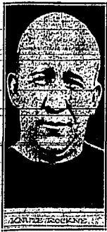
STORY OF ROCKNE READS FICTION LIKE

Wing Falls Off Aircraft Flying Through Clouds Eight Corpses Disfigured Almost Beyond Identification—Life In Little Town Awailing Coroners Probe (By The Associated Press) KANSAS, March 31.—Knut Rockne, Notre Dame wizard of football, reached the end of his dynamic career near here today in the crash of an air transport plane which he had taken with his seven companions to death. The cause of the tragedy was undisputed tonight. The witnesses, however, agreed the air liner of the Transcontinental and Western Air, Incorporated, a plane, as it soared through misty weather en route from Kansas city to the Pacific coast, was overtaken by a smaller plane. There was one suggestion that the wing of the wing could be torn away but this was unverified. Splintered wings and clouds the crippled ship hit with tremendous force on a farm 11 miles southeast of here, near the village of Hays. The six passengers and two pilots met death instantly. Five bodies were