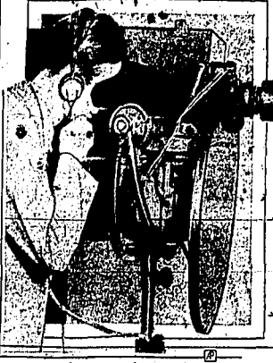
This portable television "camera" has broadcast views of speeding trains and other scenes, using only sunlight for illumination. In successful tests.