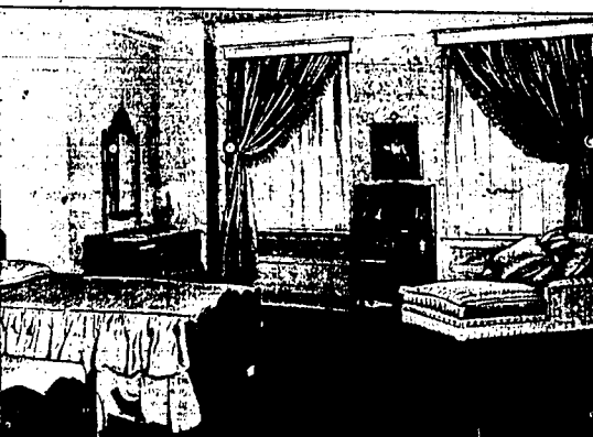
"The way curtains look, so looks the room"