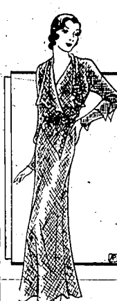
Flattering to mature figure—Cost-freeck in diagonal wool crepe. Soft jabot, individual sleeve treatment. Barbara Beaufort