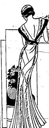
"Poured-in" effect achieved by bias-cut pink satin dress. Deep décolleté, shoulder cape outlined by dark brown Japanese. Barbara Beaufort