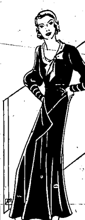
Cantone crepe dress with puff sleeves new daytime fashion. Piping on sleeves & collar. Black with chartreuse and brown. Barbara Beaufort