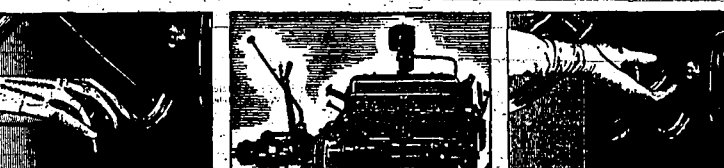
Smart Synco-Mesh Transmission

When you read what's new in the new Chevrolet Six, you too will agree it's the Great American Value for 1932. It is the only low-price car to offer both Synco-Mesh and Free Wheeling in combination.