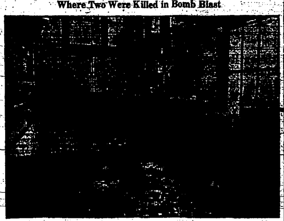
TWO POSTAL CLERKS were killed and three other clerks and a detective were injured when three of seven packages containing bombs exploded in Easton, Pennsylvania, causing the wreckage shown above in the Easton postoffice.