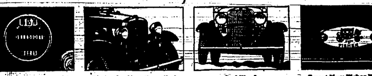
A Smoother, Improved Six-Cylinder Engine

This well-known feature of high-priced cars is the finest type of transmission ever developed. In the new Chevrolet Six, it brings a new era of handling ease and ease of control to the low-price field.