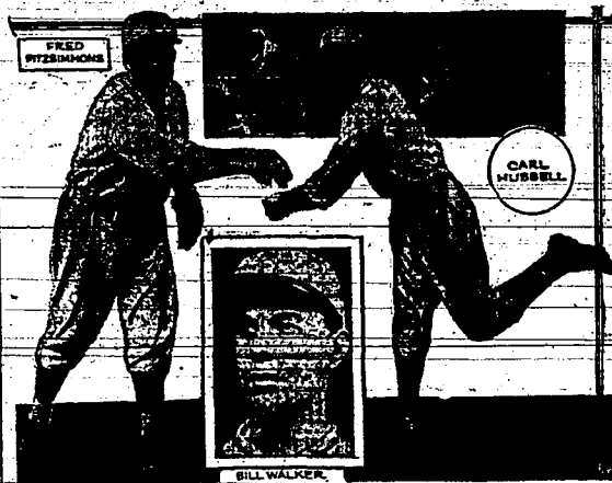
If weak pitching is keeping the New York Giants from a National League pennant, the three hurlers above don't know anything about it. Their combined average in earned runs allowed for the last three seasons is better than that of any trio on a rival club.

NEW YORK, Jan. 7.—The "Giant" hurlers would have won the pennant with better pitching. The above remark is getting to be one of the most moss-laden clichés now being used with baseball. Indeed, in baseball circles it is taking a place alongside the oft-heard phrase "the pitcher is the key to the team." It is known that the past three seasons the New York club has had a record of 100 wins in the National League, on the basis of earned runs allowed.