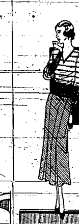
It's difficult to tell a machine-knit sweater from a hand-knit one these days. This one is soft and loosely woven.