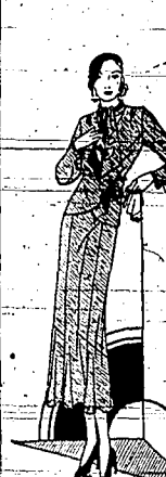
The two-piece frock pictured is of 'Reoco' crepe, the latest fabric vogue. Scarf detail is of white fur.