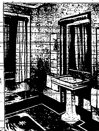
Space is important factor in the ideal bathroom

By HOPE HARMOND Interior Furnishings Editor The Woman's Home Companion Written for The Home One of the loveliest colors that has ever come into the home is the silvery lustre of chromium, now being widely used for plating the bathroom fixtures—and for decorative effects around bathroom mirrors, light fixtures and cupboards. Chromium has a slightly bluish tinge as though it were an artificial relative of pewter. It is practical as well as decorative for the bathroom. Many people do not realize how modern the bathroom is. It hasn't any enough historical background to have acquired an architecture of a definite approved form. The "ideal bathroom" should be much larger than the average present. Instead of providing light, air and sunshine, architects still plan an ideal bathroom in a room that is an obscure corner and grudgingly give it one small window. It is about time for some one to start a crusade for instance, for half of the installation of a second bathroom in every American home. It is about time for some one to start a crusade for instance, for half of the installation of a second bathroom in every American home.