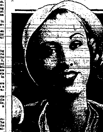
Down in the Southern resorts where spring millinery fashions are in the making a note more softly feminine appears in the new creations—hats with narrow brims or with wide brims that rest softly at the back and on one side.

(By The Associated Press) WEST PALM BEACH, Fla., Jan. 9.—Wide brims that drop in unexpected places — lower trimming — hats with narrower brims that rest softly at the back and on one side. So appears the feminine note in the new millinery showings in Florida. Then there's a bicolored blue—so named for the bay—a favored color for hats. All pastel shades are popular. Flowers trim some. And flowers—such of the spring millinery shows flower trim—the flowers either fastened against the crown or placed on the brim near it. Rough straw in both large and small weaves predominates for hats. Shallow-crowned panamas are shown for sports wear along with a floppy straw hat, as large as a parasol. For evening wear draped turbans of silver cloth are attractive, while wide-brimmed turbans of pink tulle, banded with pearls, featured a saucy nose veil. Baths Grew Shorter There seems to be a definite leaning toward the shorter skirt. The evening frock no longer rests on the floor, an inch leeway being now allowed. Sports frocks reach the turn of the leg, and afternoon frocks are almost as high. Ruffled garden party frocks clear the ground by an inch. Evening frocks are pulled tight above the knees, then begin to billow. Materials favored for day-time are rough and peppy silks, feather-weights and crepe wools, linens, and many charming versions of cotton. Buttons and waist are used as trimmings. Nipped-in Waist Popular The nipped-in waist continues popular, but many straight-line