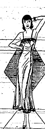
This lace-trimmed slip of pure dye crepe has straps that do not slip off the shoulder. They are stiffened at back.