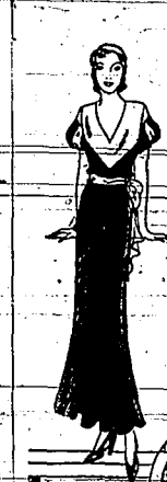
Here is a "formal-informal" dress for theater or tea. Velvet and tulle are combined in the popular light-topped fashion.