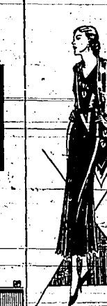
Scarfs made of the new prints are alluring and colorful. They are smart with fur or dark cloth coats.