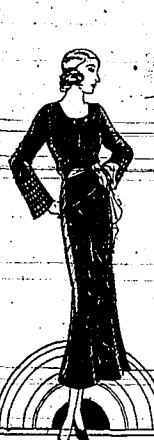
The new prints are fascinating. Fabric fagging is used in this model which has a dash of harmonizing color.