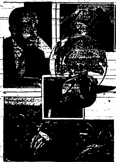
These pictures, showing a hurried glance from 1931 newspaper front pages, will give the year its place in history. The abdication of King Alfonso (upper left) marked another step in the decline of monarchism. Why Peet (at top right) and Harold Gatty (below) shown analyzing their plans, showed the nation's "vision" when they climbed the globe in less than nine days. In Moscow, Lenin (below) and his followers, and Joseph Stalin (below) and his followers, showed the new problems in world peace.

The statesmen claim that the world's economic ills are the result of the political situation.