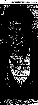
Portrait of a man, likely related to the 'Fetes His Fate' article.

After escaping injury in three years of college football at Minnesota, Clarence Munn was laid low by an attack of pneumonia which he believed was induced by the strain of banquets and speech-making which followed his selection as All-America guard.