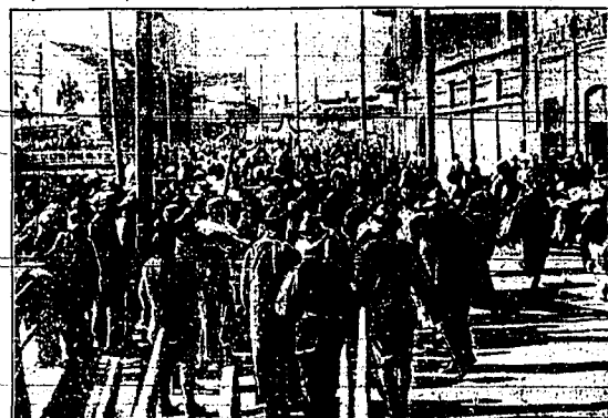
WHEN FEELING ran at fever pitch, Shanghai's international police acted to quell the disturbances. This picture shows police going into action to stop a riot in the international settlement.