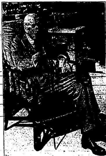
JOHN D. ROCKEFELLER spoke optimistically of the business trend when he emerged from two weeks' confinement in his Ormond Beach, Florida, winter home because of a slight cold. The 93-year-old multi-millionaire is shown in the garden of his Florida home after his illness. He said he felt fine and was eager to resume his daily round of golf.