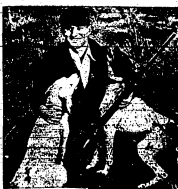
IF JOHN LEONARD (Pepper) Martin is as accurate with that shotgun as he was with his baseball bat in the 1931 world series, rabbits and other wild life around Oklahoma City are in for lots of sudden death. The Cardinals' fiddler is shown with two of his keen hunting dogs.