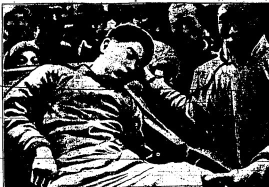
AS THE CAULDRONS of war boiled over—Here is a Chinese student injured in the anti-Japanese demonstrations that precipitated the fighting in Shanghai. China clamored for boycott of Japanese goods in protest against Japan's invasion of Manchuria. Tokyo countered with armed action to stamp out anti-Japanese activities.