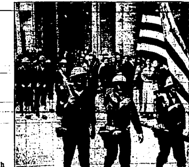
SWOOPING OVER A COTTON mill in Shanghai where United States marines were billeted, Japanese airplanes released bombs which completely wrecked the building. At least 19 marines narrowly missed death. Above picture shows marines stationed at Shanghai marching through Chapel district.