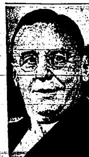
RECENT PICTURE of Anton J. Cermak, mayor of Chicago. — (P) Photo.