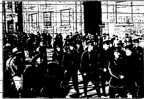
JAPANESE TROOPS in Shanghai were called out to protect their nationals when the situation reached a climax. Here they are marching through the international settlement. — (P) Photo.