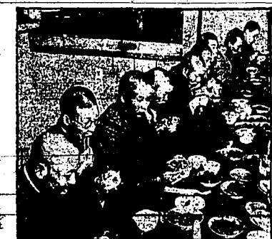
JAPANESE SOLDIERS still find time to eat between battles with the Chinese in and near Shanghai. This picture shows a group of apparently well-fed and clothed troops as they enjoyed mess—with chop-sticks much in evidence.