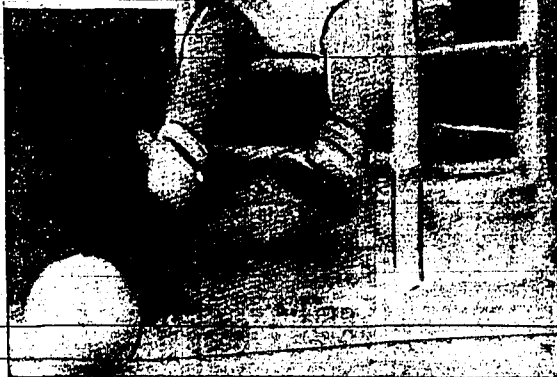
of one of the latest pictures taken of Baby "Lindy, jr.," playing "football" in the nursery of the Lindbergh home. It was a snap shot taken while the little one played unawares.