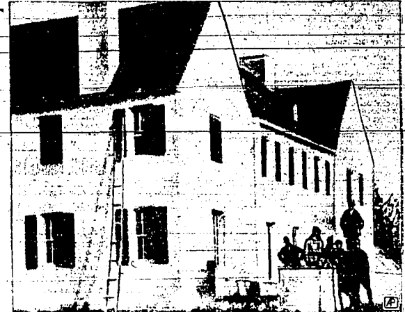
showing the police at the home of Colonel and Mrs. Lindbergh recreating the crime as read in the evidences left behind. The ladder used to enter the home is shown at the nursery window through which entrance was made and the little one removed.