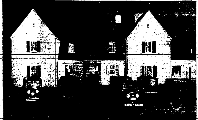
ASSOCIATED PRESS TELEPHOTO of a scene in front of the home of Colonel and Mrs. Charles A. Lindbergh at Hopewell, New Jersey, shortly after their son had been kidnaped. He was stolen from his crib in the nursery. The woman in the group in front of the door is Mrs. Lindbergh.