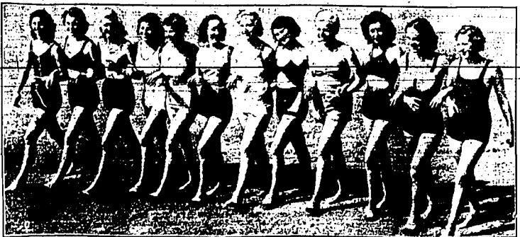
HERE THEY COME SWINGING down the strand—bathing beauties passing in review. But after all, the purpose of this picture is to show you the variety of suits offered for water enthusiasts in 1932. The girls are on the beach at Santa Monica, California. Many of the styles shown have been exhibited on continental beaches.