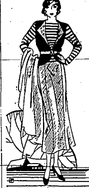
This sportier ensemble features the bright-colored sleeveless jacket of suede material. Blouse is striped and skirt white.