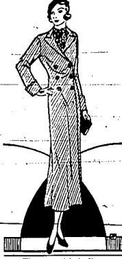
The mannish influence is noted in this spring coat of light green wool of a diagonal weave. It has a double-breasted closing.