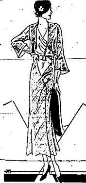
The dress with matching jacket is a smart and popular costume. This one is designed for the more mature figure.