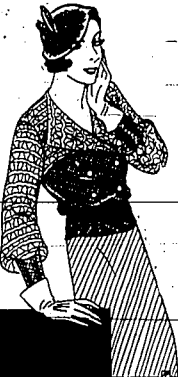
Long-sleeved sweaters are preferred by many women. This gray knitted model has a double-breasted bodice and wide revers.