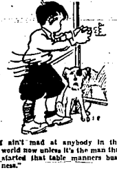
He ain't mad at anybody in the world now unless it's the man that started that table manners business.