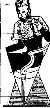
The separate fur cape is a smart accessory note and a perfect companion for the sheer woolen dress or collarless coat.