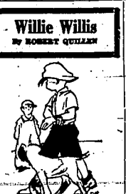
The doctor handed my cat and my nobody could do how had I was wounded if I had got the nose blood 'n' dripped on it.