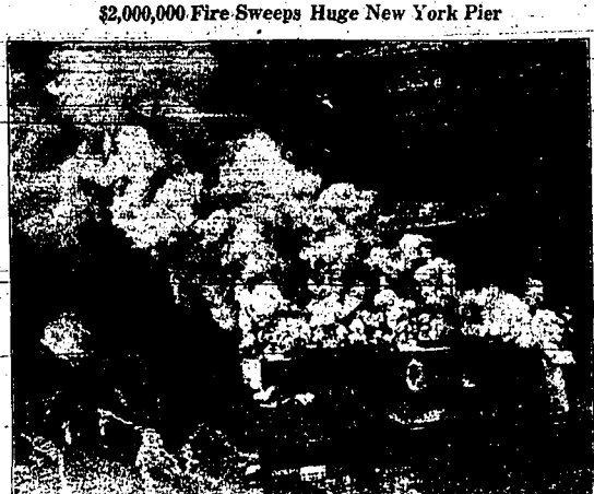
THE MOST STUBBORN FIRE in New York's recent history wrecked the giant Cunard liner on the Hudson river causing more than $2,000,000 damage. One man was killed and about 300 firemen suffered injuries while battling the blaze.