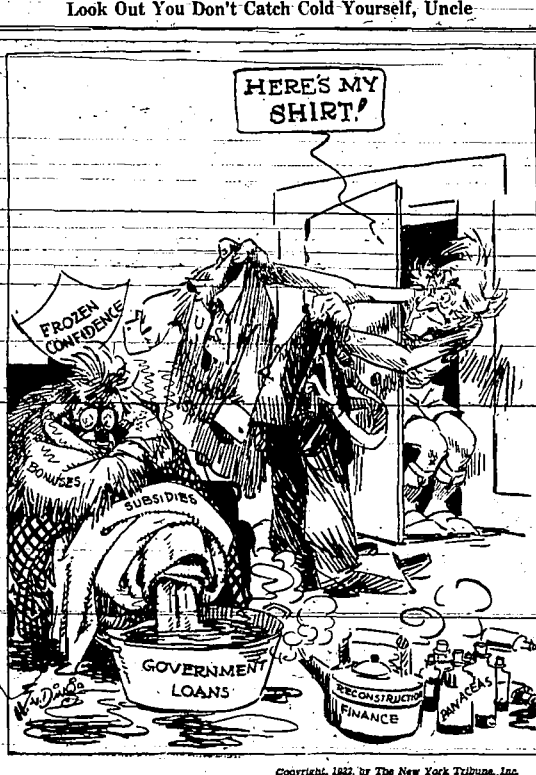
HERE'S MY SHIRT!

ATLANTIC CITY, May 20 (AP)—Plans of the Liberty party to nominate a congressional ticket at a state convention held in Boise May 24 were made public here today.