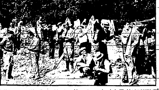
WITH MORE THAN a thousand bonus-seeking veterans already in Washington, some are apparently settling there for an extended encampment. Here is a "wash day" scene at the camp of the Oregon delegation, in which more than 300 men are billeted in an abandoned warehouse.