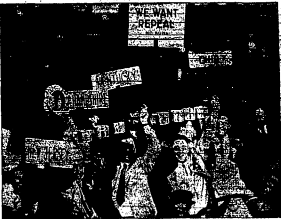
ASSOCIATED PRESS TELEPHOTO of big upheaval in the Chicago stadium as wets paraded in a demonstration in favor of outright repeal of the Eighteenth amendment at the first night session of the quadrennial meeting of Republicans.—(7) Photo.