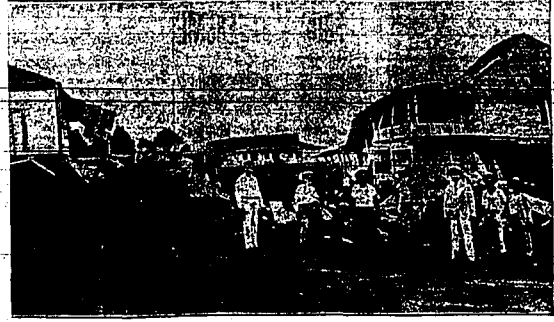
A WALL OF WATER 90 feet high toppled houses like these to the ground as it swept over Cuyulunan, Mexico. The wave rolled over the Pacific port settlement after a sharp earthquake and took a toll of 34 lives.