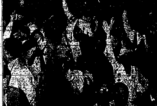
ASSOCIATED PRESS TELPHOTO of the turmoil at the Democratic national convention in Chicago's stadium as supporters of a "wet" plank cheered Al Smith and his speech for the majority report.—(AP) Photo.