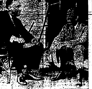
Governor FRANKLIN D. ROOSEVELT, homebound after a vacation cruise along the New England coast, stopped at Beverly Farms, Massachusetts, to visit Colonel Edward M. House (right), former adviser to Woodrow Wilson.