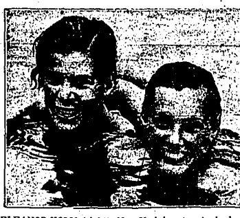
ELEANOR HOLM (right), New York beauty who broke the women's world record for the 100-meter backstroke swim in trials for the Olympic games, is shown with Bonnie Mealing of Australia, holder of other world backstroke records.

Somersaulting Backward, Values Suddenly Part Company with Stocks