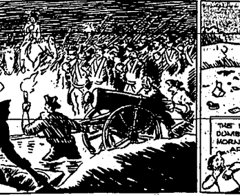
THE BRITISH WERE DUMBFOUNDED NEXT MORNING TO FIND THAT THE ARMY WHICH THEY HAD BELIEVED TO BE ENTIRELY DISAPPEARED.