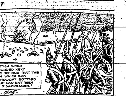
THE BRITISH WERE DUMBFOUNDED NEXT MORNING TO FIND THAT THE ARMY WHICH THEY HAD BELIEVED TO BE ENTIRELY DISAPPEARED.

Real Property: Northeast Quarter of the Northeast Quarter (NE 1/4 NE 1/4) of Section Fifty-six (56) Township Fourteen (14) South, Range Fourteen (14) E. B. M.