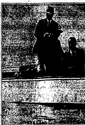
IT'S A LONG TIME between fishing trips for President Hoover and he didn't lose a minute enjoying his favorite sport during a fishing cruise on Chesapeake bay.