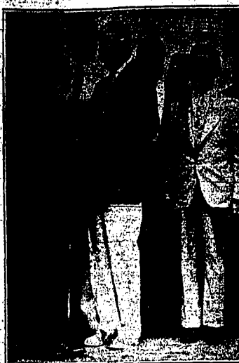
PRESIDENT HOOVER, standing on a porch of the executive offices, is honoring a distinguished flying cross on Wiley Post...