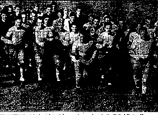
THIS PICTURE might have been taken nearly anywhere in the United States. However, it happened to be at Georgia Tech where 1932 gridiron candidates were galloping through some limbering up exercises. Tech's gridirers, heavier than usual, are expected to scrap for Dixie football honors.