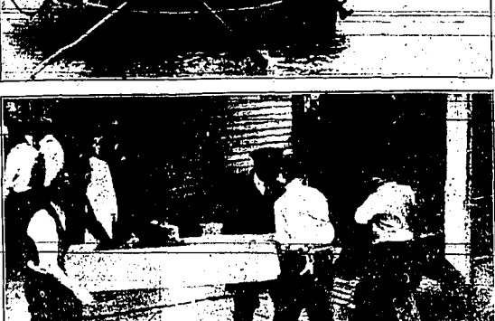
These Associated Press photographs give graphic views of scenes following the explosion of an old wooden steambunk in the East river near Hell Gate, New York.

Assessed valuation of property in Twin Falls city approximates $4,875,000, according to figures recently furnished by J. C. Farnsworth, county auditor, and presented to the city council in its session last night.