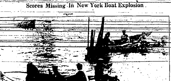
Scores Missing in New York Boat Explosion

PROPERTY VALUE FIGURES DECLINE Valuation Here Approximates $4,875,000, About $196,500 Below 1931 Amount