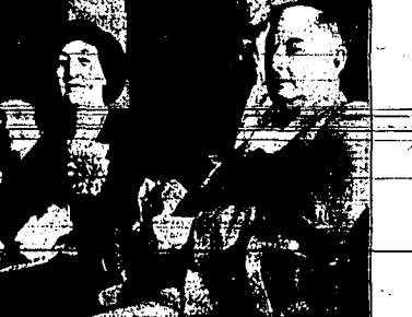
MRS. MIRIAM A. (MA) FERGUSON won the Democratic nomination for governor of Texas. She is shown in the center of the speaker's platform at the state convention at Lubbock shortly after her nomination had been declared. Beside her is her husband, James E. Ferguson, who has been in the limelight of Texas politics for 18 years.