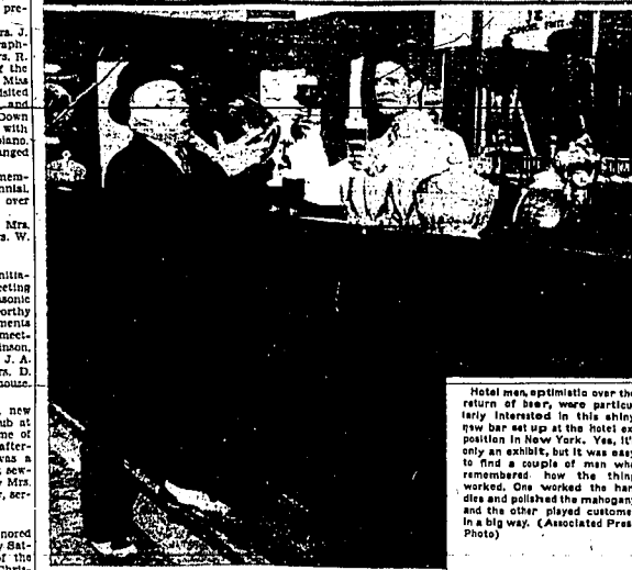
Hotel men optimistic over the return of beer, were particularly interested in this shiny new bar set up at the Hotel exposition in New York. Yes, it's only an exhibit, but it was easy to find a couple of men who remembered how the thing worked. One worked the handle and polished the mahogany and the other played customer in a big way.