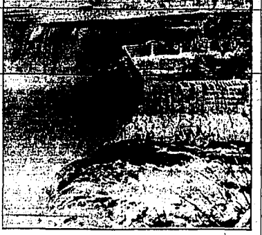
USING TUMBLING-water as the central theme, winter painted a fantastic picture around Niagara Falls, using his customary mediums of snow and ice. This view taken from Goat Island shows Luna Island and the American Falls.