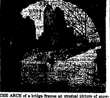
THE ARCH of a bridge frames an unusual picture of snow-crueted rusticity bordered by skyscrapers in the heart of New York. The deepest snow New York has seen in nearly a decade made the park the center of winter sports activities. Children in particular lost no time in getting out with their sleds.