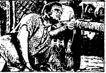
Douglas Fairbanks in "Mr. Robinson Crusoe," at the Orpheum today.