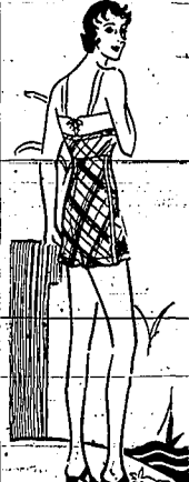
The gingham bathing suit is fashion's favorite for 1933. This model is made of a navy red and white gingham.