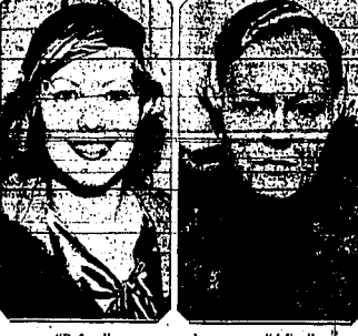
"Before" and "After" ALTHOUGH THE RESULTS aimed at reverse the usual object, those who attended the Los Angeles convention of the National Association of Teachers of Speech were given a demonstration of the effectiveness of makeup.