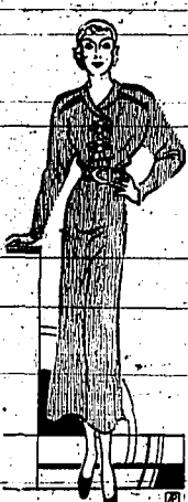
Here is a yellow wool crepe dress with new copper accessories, and shoe strings ties introduced by Schiaparelli. Note shoulder tucks.