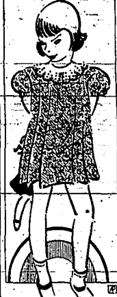
A crisp white collar, embroidered and faceted, adds charm to the child's small patterned print dress.