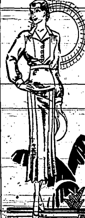
Illustrated above is a new shade finished silk crepe two-piece sports dress in a new delicate dusty pink.