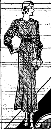
Sketched is a chic frock of tough crepe. Attack of hand-blocked scarf makes the sleeves and back closing bodice.