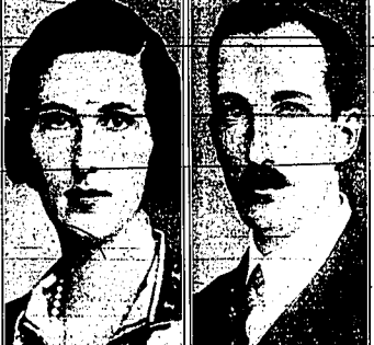
THEIR FIRST CHILD, a daughter, was born in Sofia to King Boris III and Queen Yvonne of Bulgaria. Although Bulgaria's constitution prescribes direct succession by the male line, the princess was welcomed by the country with a warmth of affection. The mother, a former Italian princess, and King Boris were married two years ago.