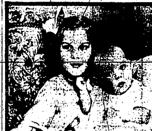
THE TWO ATTRACTIVE children of Prince and Princess of Denmark are pictured here...