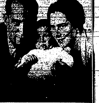
ARCHDUKE ANTON of Hapsburg and the Archduchess Helena, formerly Princess Helena of Romania, are shown with their son, Stefan, born last August.