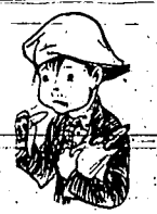
"The bananas all looked alike, but I think it was the seventh one that made me kinda sick."