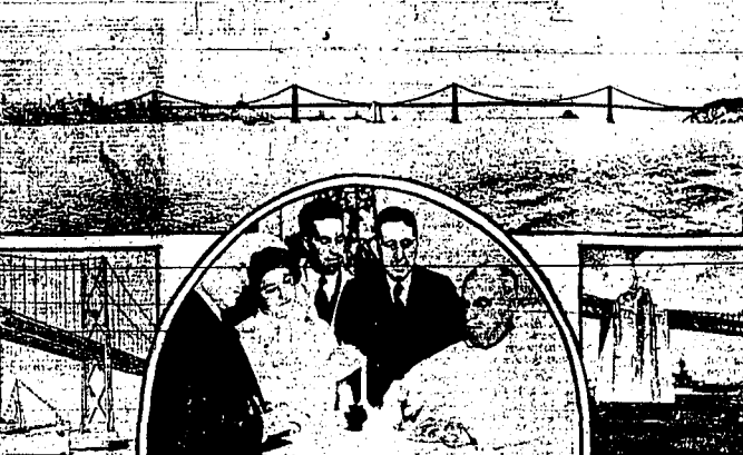
SIGNING OF SIX bills passed by the legislature by Governor James Rolph, jr., (center) cleared the way for California to borrow $82,000,000 from the Reconstruction Finance Corporation for erection of an eight and a quarter mile bridge from San Francisco to Oakland, with a 340-foot tunnel through Yerba Buena Island. Upper: artist's conception of the 10,450-foot crossing from San Francisco to the island. Lower left: One of the towers indicating the height above the waterline and (right) a concrete island which will be erected as an anchorage for the two suspension spans. Work will commence this year.