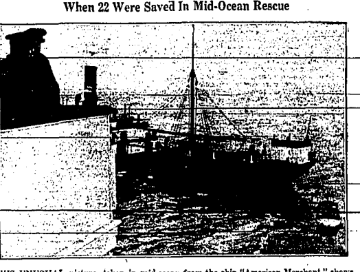
THIS UNUSUAL picture, taken in mid-ocean from the ship "American Merchant," shows a lifeboat leaving the British ship "Exeter City" with some of the 22 crew members who were saved after the "Exeter City" became water-logged from effects of a hard storm in the North Atlantic.

Wheat closed easy, unchanged to 1/2 cent, compared with yesterday's high, but unchanged to 1/2 cent down, oats showing 1/2 to 1 cent decline, and provisions unchanged.