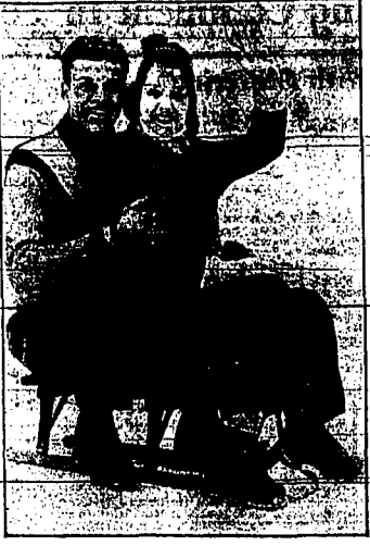
ALL BUNDLED up in winter togs, her red hair tucked under a stocking cap, Clara Bow, film actress, is all set to swoop down the mountain side at St. Moritz, Switzerland, with Rex Bell, her husband.