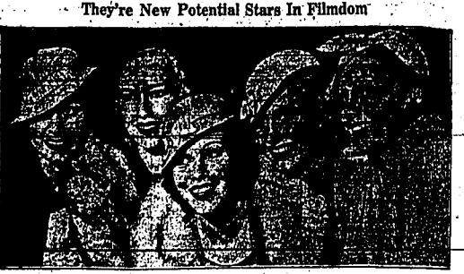
THESE FIVE GIRLS, who have signed motion picture contracts with a Hollywood studio are among the latest imports of the film colony.