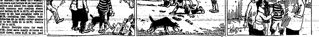
GASOLINE ALLEY-CAR CONSCIOUS. A cartoon by E. J. Bannister showing a man with a foot in a gas pump and a car crash.