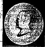
THIS MEDAL, designed by Paul Manship, New York sculptor, will be cast in gold by the Philadelphia mint to commemorate the inauguration of Franklin D. Roosevelt.