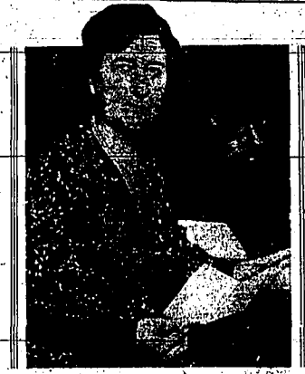
HERE IS a recent portrait of Mrs. John N. Garner, wife of the vice-president-elect.