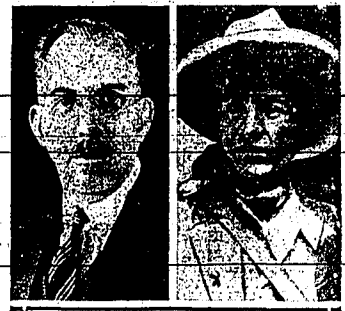
GENERAL AUGUSTO SANDINO (right), colorful Nicaraguan liberal leader and foe of United States marines, in a surprise visit to Managua, capital of Nicaragua, made a pledge of peace with President Juan Bautista Saca. The peace promise came after six years of revolt against the American-advised government. Sandino had often said he would continue his struggle until the last marine had left Nicaragua. The marines evacuated this country January 1.