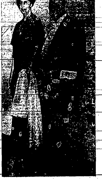
MAYOR ANTON J. CERMAK is pictured here with Mrs. Franklin D. Roosevelt when the next first lady appeared before the Illinois League of Women Voters. Cermak was shot when a Miami, Florida, man opened fire on President-elect Roosevelt.