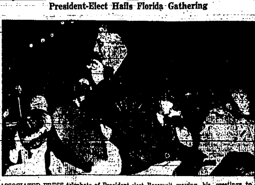
President-Elect Hails Florida Gathering