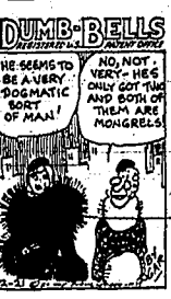
HE SEEMS TO BE A VERY DOGMA TIC SORT OF MAN!

Class B Standings South Side Sub-District Team Won Lost Pct. Castell 1 0 1.000 North Side 1 0 1.000 Castell 1 0 1.000 North Side 1 0 1.000